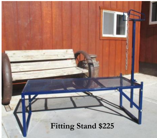
Fitting Stand $225