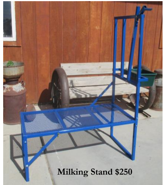
Milking Stand $250

Custom stands also available! (mini size, 8 goat, custom height, powder coated, etc.)